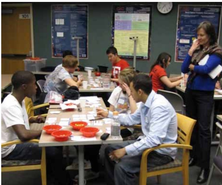
Figure 3. Teens explore strategies for reducing climate change through games.

that can be answered in the wrap up conversation. In a typical 90-minute café, this usually works out to a presentation of 15 - 20 minutes, an activity for 10 to 40 minutes, and the remaining time for discussion.