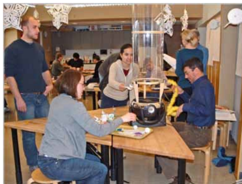
Figure 2. Vetting and training presenters is often done through role play in groups, which gives them confidence in their presentation.

experience was beneficial to me as a scientist in that preparing an interactive talk for an audience of young people helped me identify the critical issues in my work: why I was doing it, why it is challenging, what we are trying to accomplish (vs. being bogged down in technical details). This really focused my thoughts about my work.”