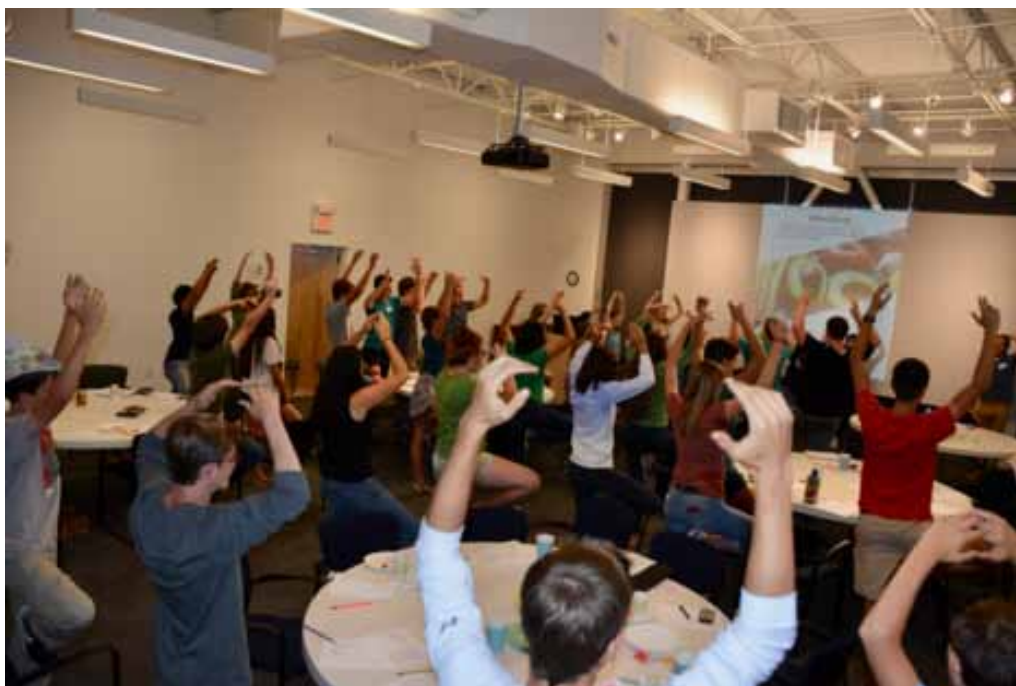
Figure 4. Teens engage in an icebreaker at a café event focused on Managing Stress Through Yoga

appropriate verbiage and content for the presentation. It also helped me gauge the level of delivery. Furthermore, I found the student input extremely important in identifying what their peers would find interesting. After the dry run, I made significant changes to the presentation, including the elimination of confusing content, identification of real-world connections, and simpler examples.”