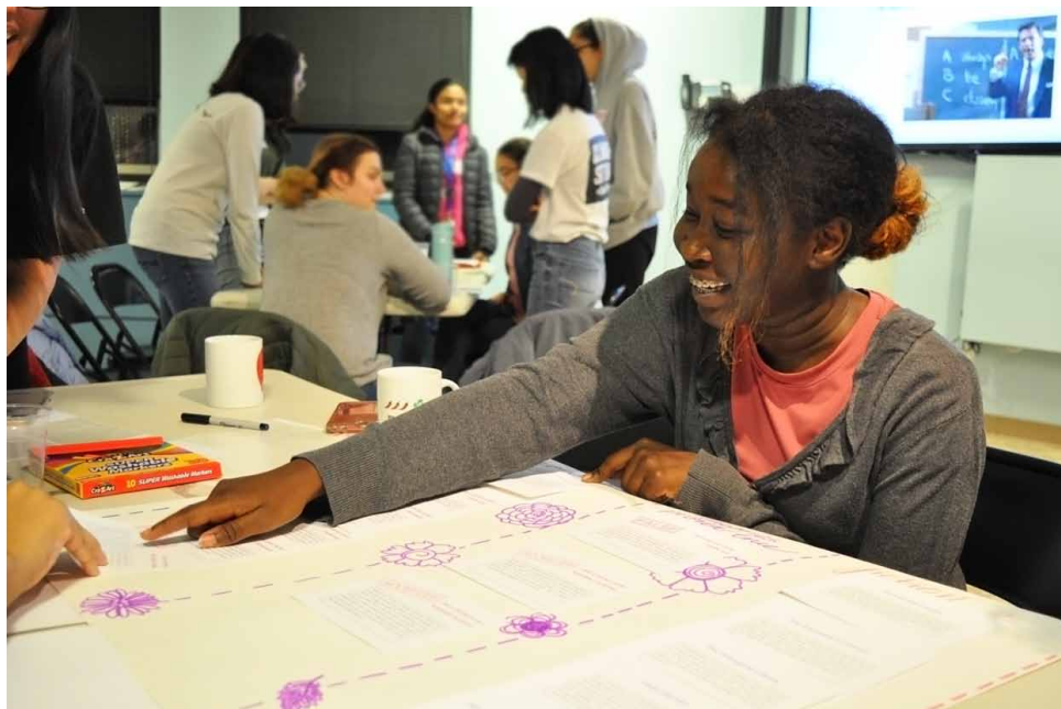
Figure 5. Teens gain skills in leadership and confidence to reach out to science experts.

“For me it was the topics and the format and how it was very intimate, and everybody could kind of ask questions and have conversation, that was really nice.”