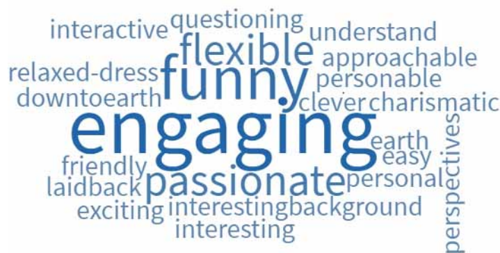
Figure 6. This word cloud gets across desired qualities in a teen science café presenter

“It helped me to think about the basics of my research and discipline, and to rephrase.”